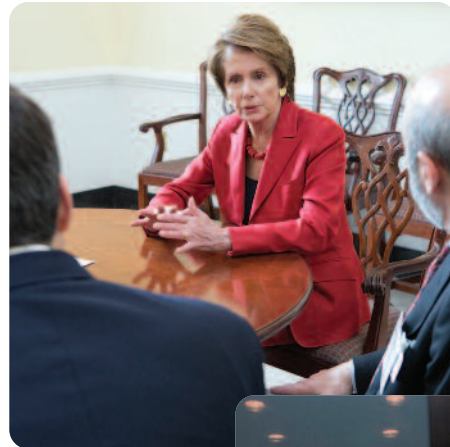
▲ House Minority Leader Nancy Pelosi (D-CA)

While in Washington, the organizations also took time to recognize U.S. Rep. Rosa DeLauro (D-CT) and Sen. Richard Shelby (R-AL) for their tireless work to enhance appropriations for NIH and their commitment to cancer research. The lawmakers were honored with cancer leadership awards during an evening reception.