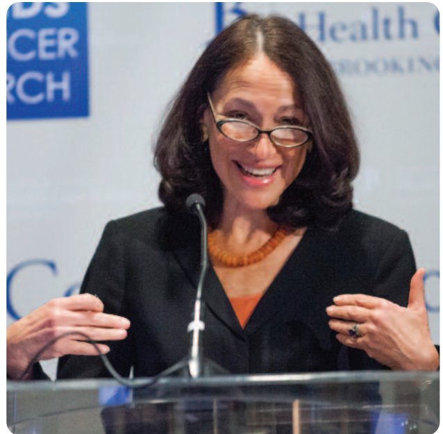
Margaret Hamburg delivers her keynote remarks