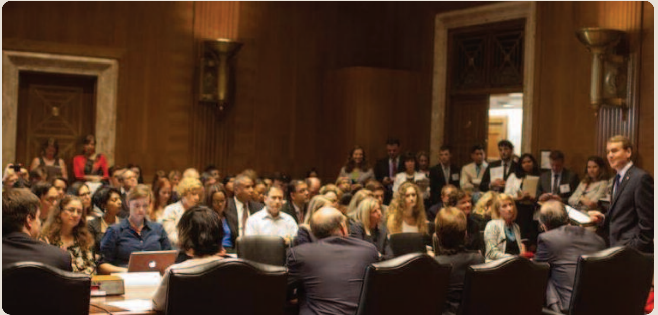
Sen. Michael Bennet (D-CO) delivers keynote remarks