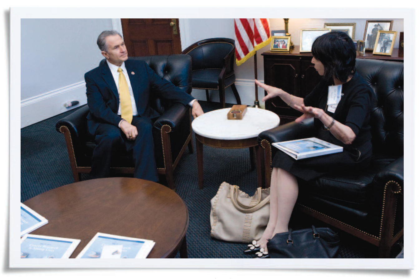
Rep. Herger (R-CA) and Ellen Sigal discuss congressional support of biomedical research