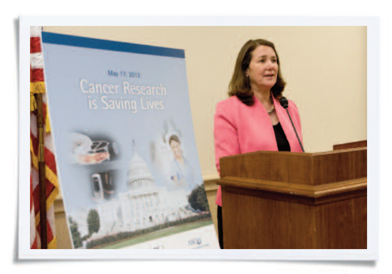
Rep. DeGette (D-CO)