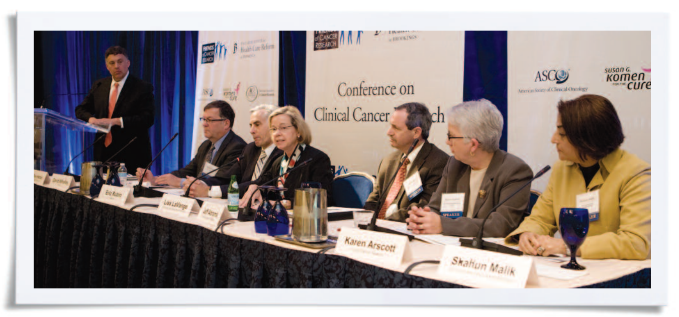
Panel Two Participants Discuss Master Protocol