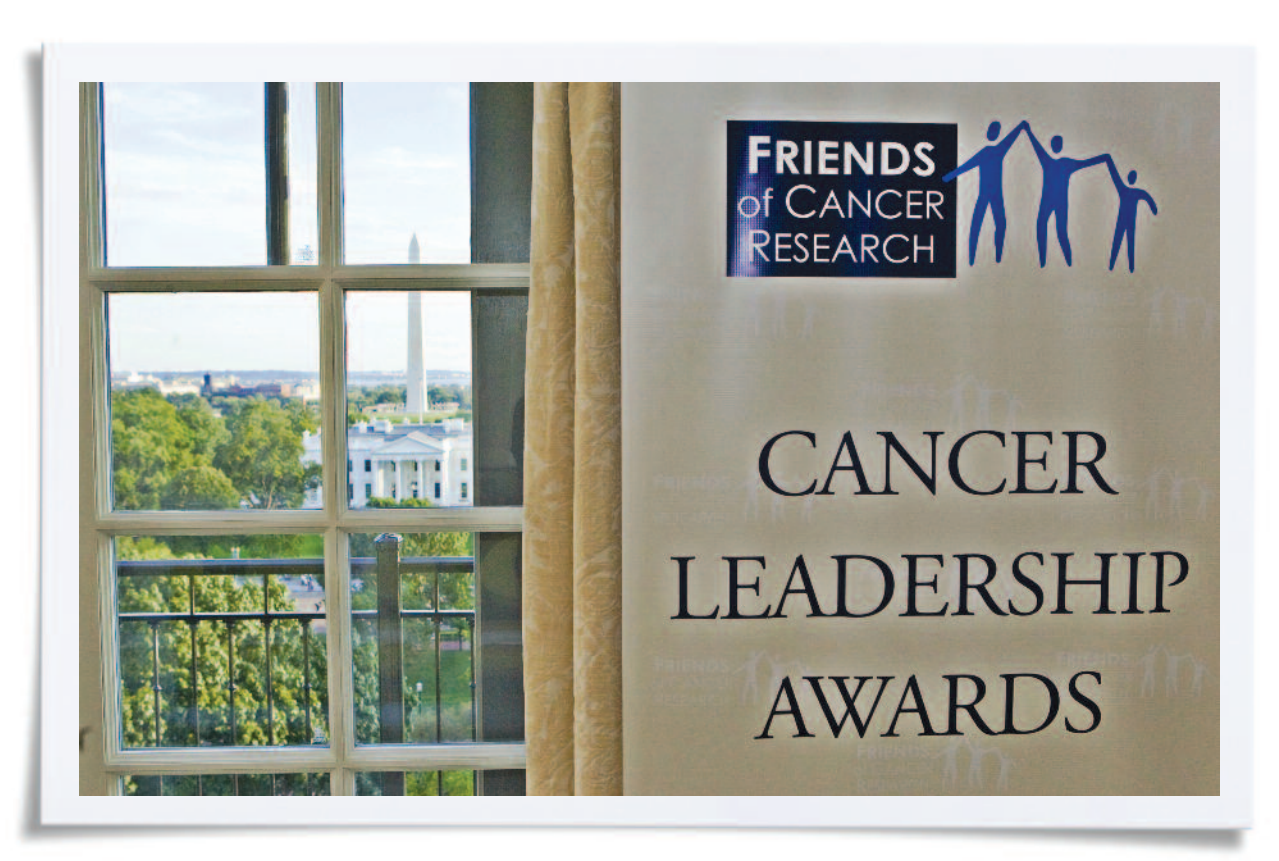
The view from the Hay-Adams during 2012 Awards Reception