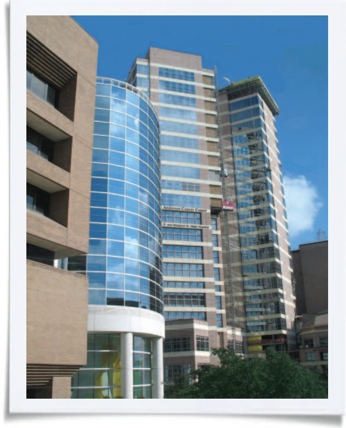
MD Anderson Cancer Center

The symposium examined specific side effects of cancer therapies, including cardiotoxicity, pulmonary damage from radiation or chemotherapy, metabolic toxicities, immune toxicity, and peripheral and central neurotoxicities. Speakers discussed what is currently understood about the mechanisms of these toxicities, ongoing efforts to reduce their occurrence, and how to move forward in each of these areas. From these talks, six common areas of need emerged: 1) the ability to predict patients at risk for specific toxicities; 2) mechanism-of-action studies; 3) early phase trials directed at measuring toxicities; 4) improved patient-reported outcomes and quantitative metrics; 5) the ability to learn from other therapeutic areas; and 6) improved strategies for determining dose and scheduling to achieve optimal response and tolerability.