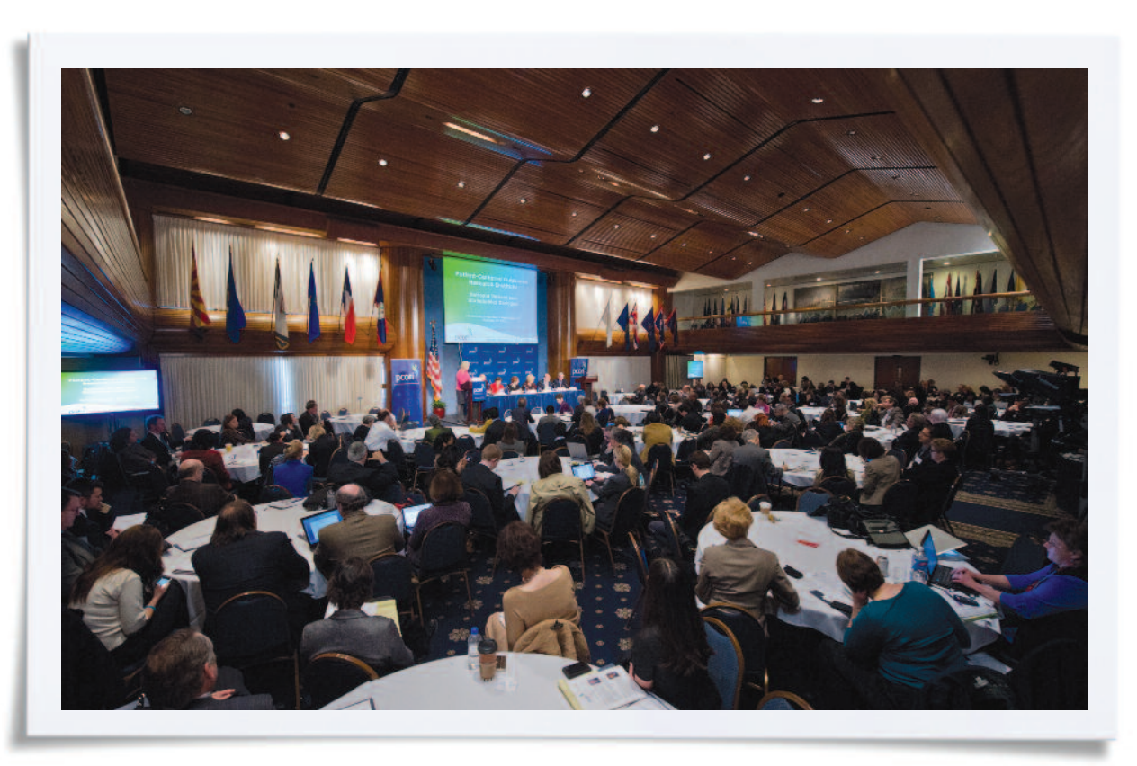
{\tt PCORI\ National\ Patient\ and\ Stakeholder\ Dialogue\ Forum\ in\ Washington\ DC}