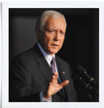
Sen. Hatch (R-UT)