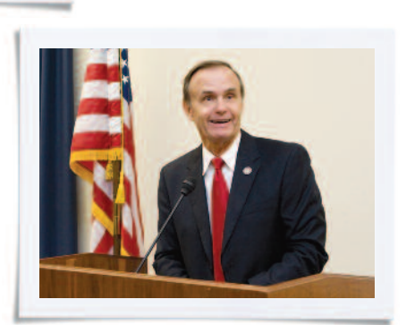
Rep. Bilbray (R-CA)