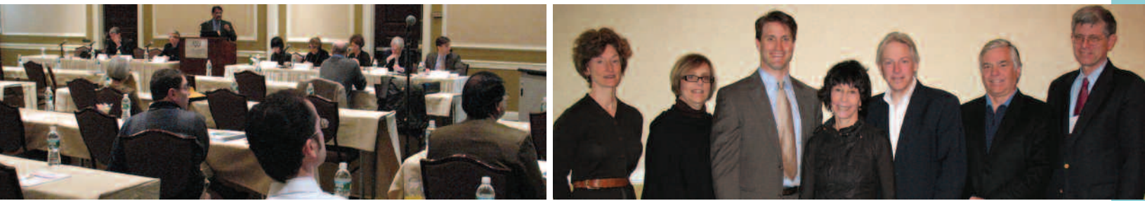
EDRN Panel Discussion

National Cancer Institute's Early Detection Research Network (EDRN)